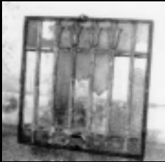
Broken clerestory window