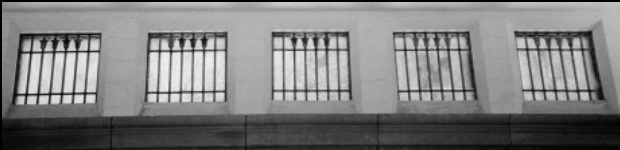
Replication of the original golden glass is in progress.