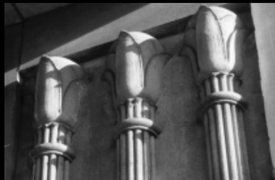
Precast concrete detail from Hope Abbey Mausoleum, built 1913-14.

After many, many years of deterioration and inactivity, Hope Abbey is once again an operating mausoleum. Crypts and niches are now available for purchase. For more information, please contact the Eugene Masonic Cemetery at (541) 684-0949.