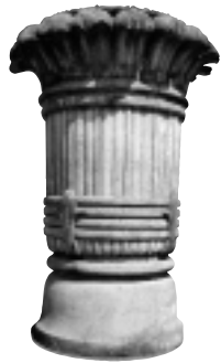
Precast concrete urn with lotus blossom appliqué.

“Mausoleum” takes its name from King Mausolus of Halicarnassus, for whom his wife built a magnificent tomb in 353 BC. The tomb is one of the seven wonders of the ancient world. Mausoleums became fashionable in late 19th century America as knowledge of and enthrallment with antiquity swept the country, and tycoons