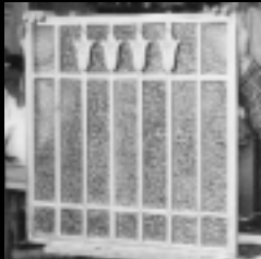
Repaired clerestory window

The endowment fund for Hope Abbey's maintenance was, alas, totally inadequate. The Portland Mausoleum Company went out of business in 1929, and the Masons had no crypts left to sell for income. Over the years, the building fell into serious disrepair with a leaking roof, groundwater seepage, broken clerestory windows, and graffitied bronze doors and walls.